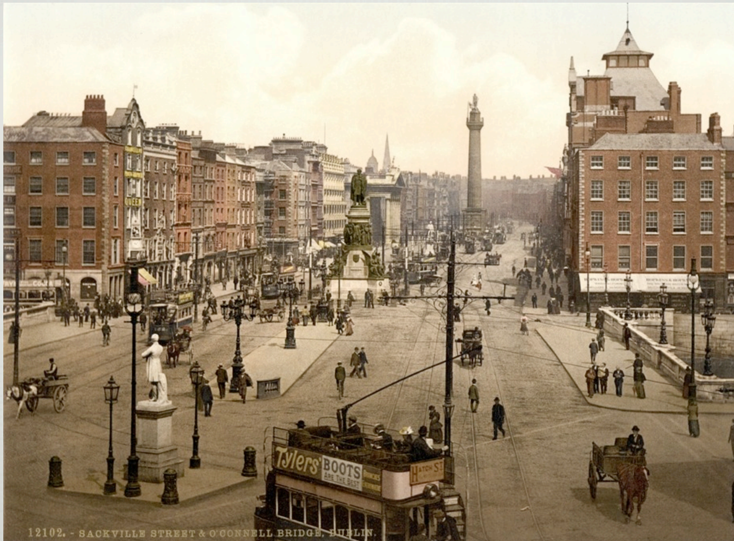
12102. - SACKVILLE STREET & O'CONNELL BRIDGE, DUBLIN.